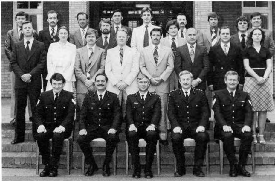
Better late than never ... Graduates and instructors pose for a formal group photograph on Friday, 19 October — 'Day One' of the new force — at the conclusion of an 18-day Crime intelligence training course. 'Platypus' apologises that the above was held over from the first issue for space reasons.