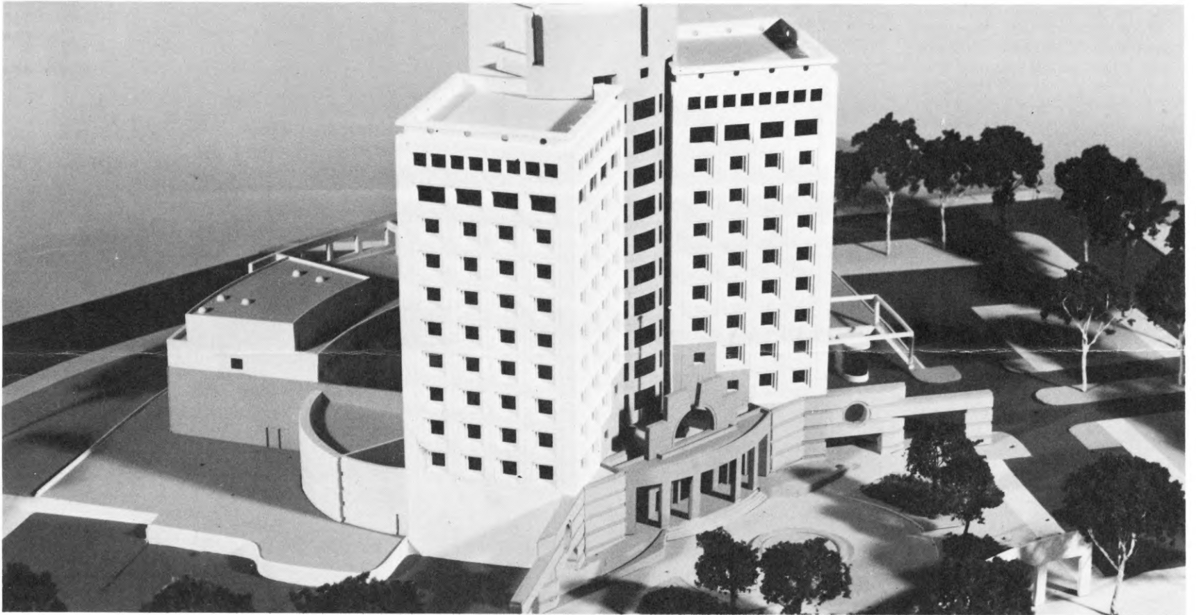
A model of the new AFP headquarters planned for Canberra. It is due to be ready for occupation in 1987.