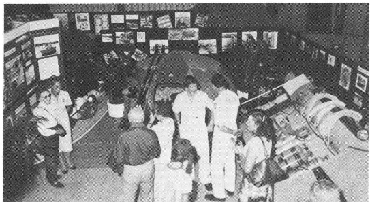
The AFP stand at the show proved of interest to many adults, as well as the youngsters.