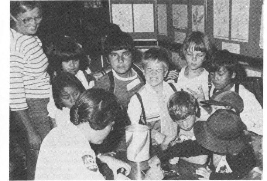
• Children attending Royal Canberra Show crammed the AFP display to see how their fingerprints looked.

The stands were manned in shifts throughout the three days from 8 am until 11pm.