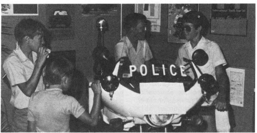
A particularly popular exhibit was this police patrol motocycle. Below, road safety explained for younger cyclists.