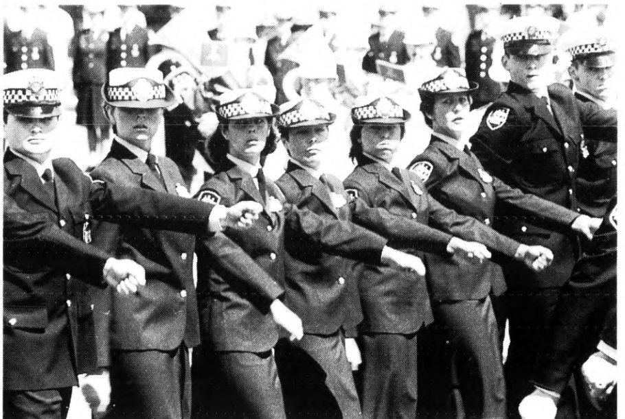
● Right on to a chequered career!