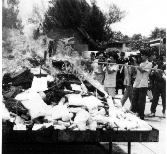
Platypus 34 - January 1992