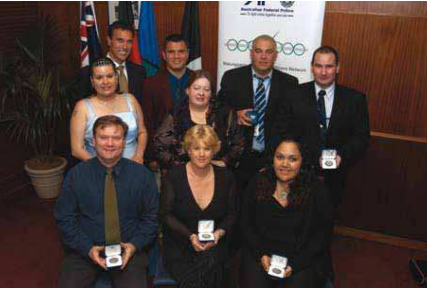
Left: MION members presented with the newly created MION Medallion.

Strait Islander descent, who are working in various capacities throughout our organisation.