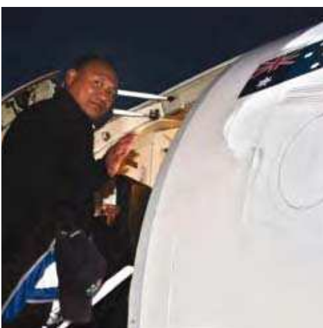
Left: The flight leaves Canberra.