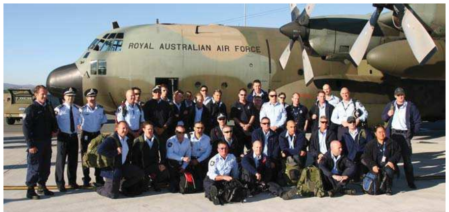
AFP members departing Canberra on 18 November.

"The AFP has a long-standing relationship with the Tongan Police Force through its members working alongside us in the Solomon Islands and participation in AFP training programs in Australia. It is important that Australian police help our law enforcement partners in the Pacific