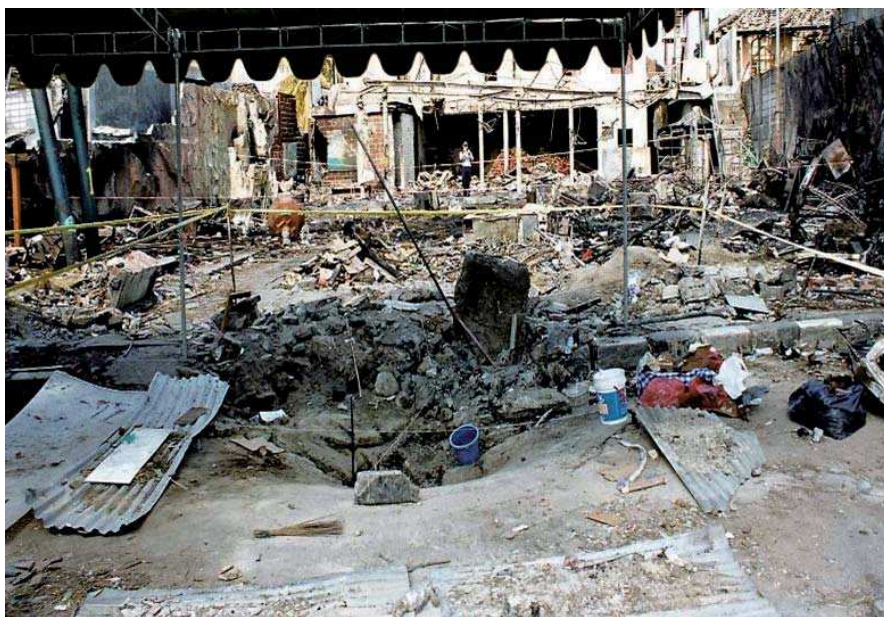
Above: a post-blast investigation site. Far right: the Isotope Ratio Mass Spectrometry as used by the Chemical Criminalistics team

“As part of responding to a post-blast investigation where ammonium nitrate may have been used, the team tests a