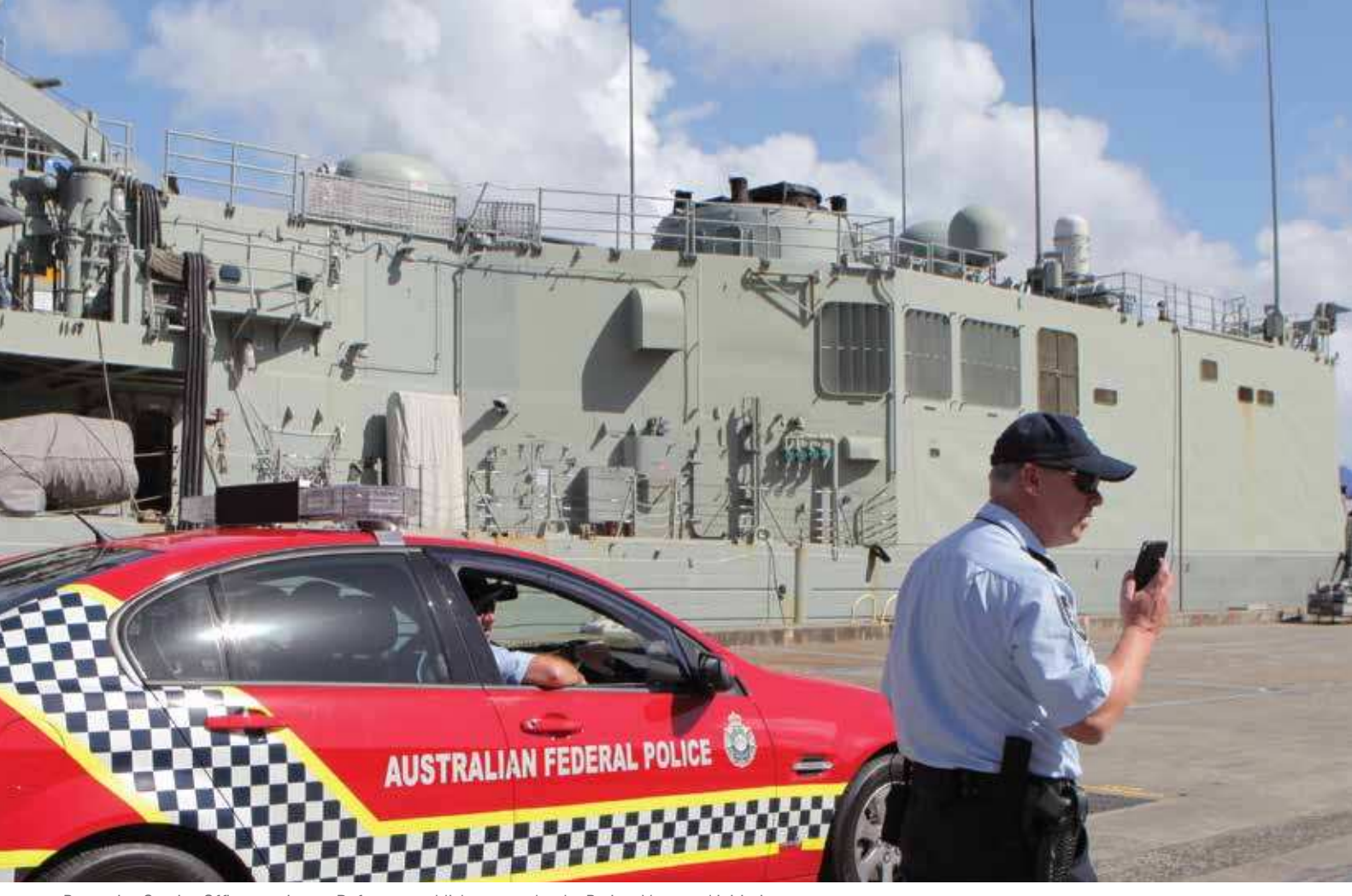
Protective Service Officers train at a Defence establishment under the Project Vanquard initiative.