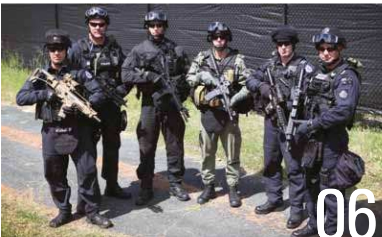
06: AFP Operation Response Group members with their multijurisdictional Counter Assault Team members.

But just like the transition from India's Commonwealth Games to CHOGM, the Protection team has already turned its focus to the 2012 London Olympics. And not long after that, the 2014 G20 Summit, 2015 FIFA Asia Cup, and the 2015 Cricket World Cup in Australia, and the centenary of Anzac Day in Gallipoli in 2015.