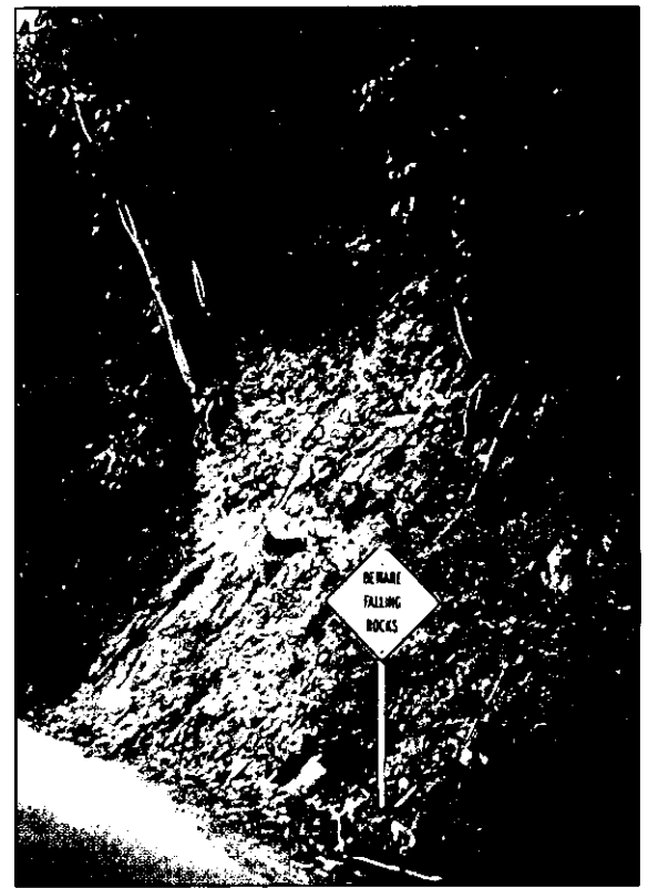
above: This landslide on Barron Gorge Road was triggered by rain brought by Tropical Cyclone Justin in March 1997.

landslide magnitude-recurrence relations were derived. As the error bars for the data points are, in some cases, more than two orders of magnitude, errors in the risk estimates may be large.