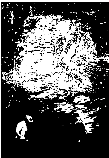
above: This large boulder was part of a prehistoric debris flow in Redlynch, Cairns.

considerably less than that shown in the Table 2.