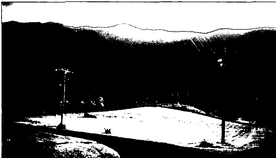
above: The raised, cleared land between the power poles is part of a debris flow fan built by debris flows from the mountains in the background.