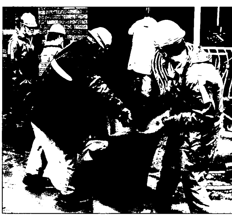
Examining the impact of a disaster immediately after the event has been a role for the Centre for Disaster Studies since it was first established in the 1970s.