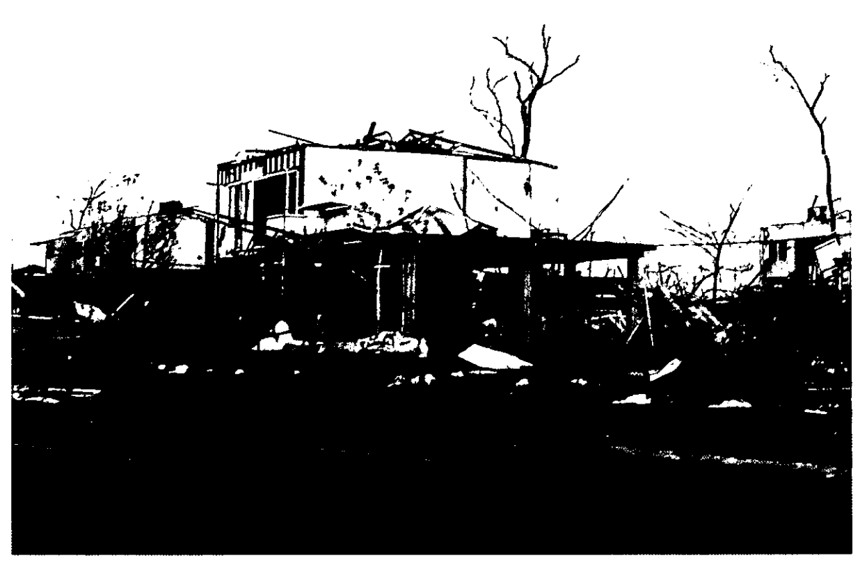
Type of impact varies enormously so survey questions must also suit various places and events.

that the river had never risen so high before, or the floodwaters had never been so extensive. This is usually quite true, for any individual, but the devastating natural hazard is a predictable process at the State level. People who experienced severe loss of property, experienced that loss precisely because they never expected it (Goudie & King 1997).