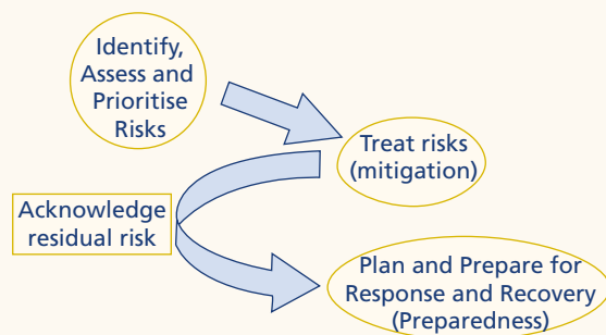
Figure 1. Emergency Risk Management Linked to Operational Planning.

In a public administration activity such as emergency management, there are those who would argue that a shortcoming to an approach is not a problem, as long as there is a some actual and hopefully beneficial activity taking place. However, the major benefit of the emergency risk management approach is to pursue all the means other than response and recovery of reducing the likelihood and/or potential consequences of