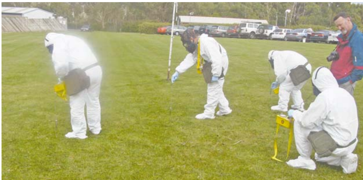
Radiation Instruments Training – Students practice area survey methods using CDV radiation instruments

upon existing State/Territory arrangements to respond to deliberate CBR incidents and is seen as a significant boost to Australia's overall CBR response capability.