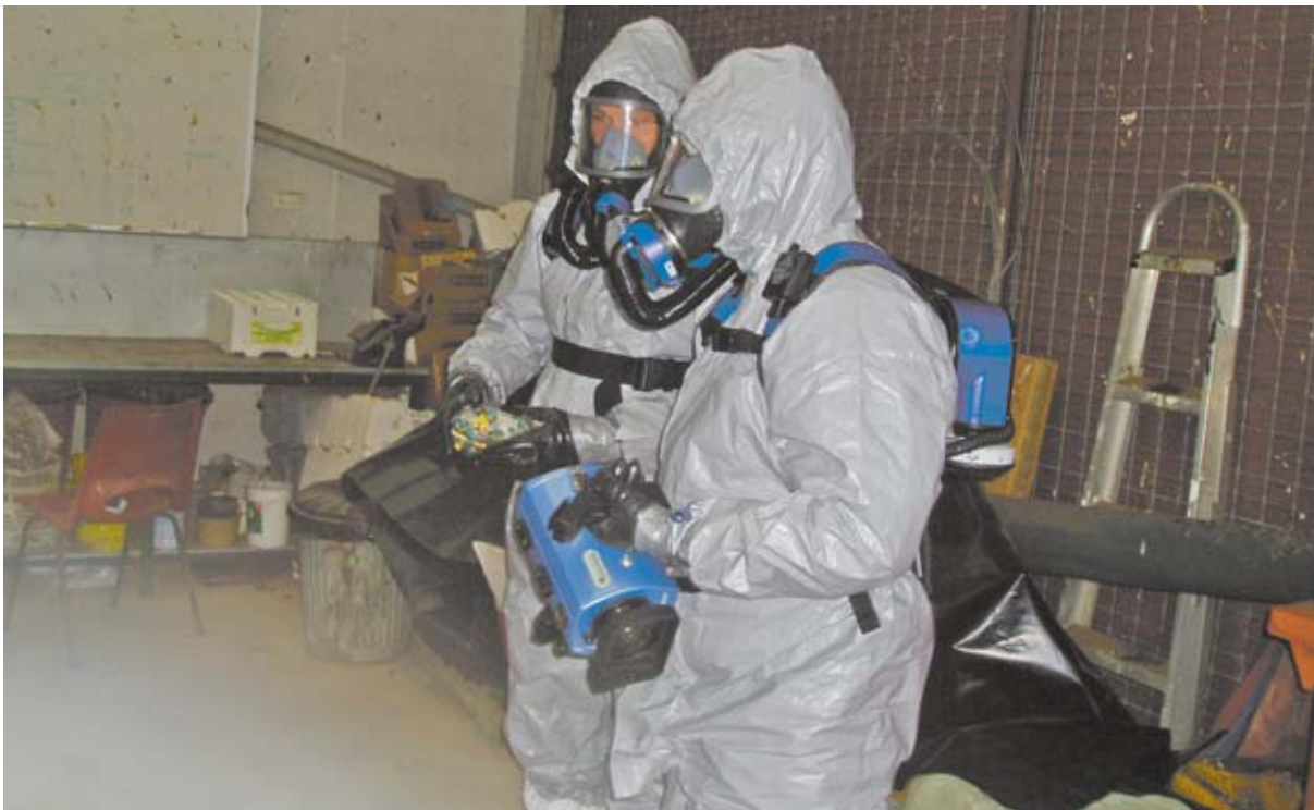
CBR Crime Scene Investigation – Students prepare to record a contaminated crime scene