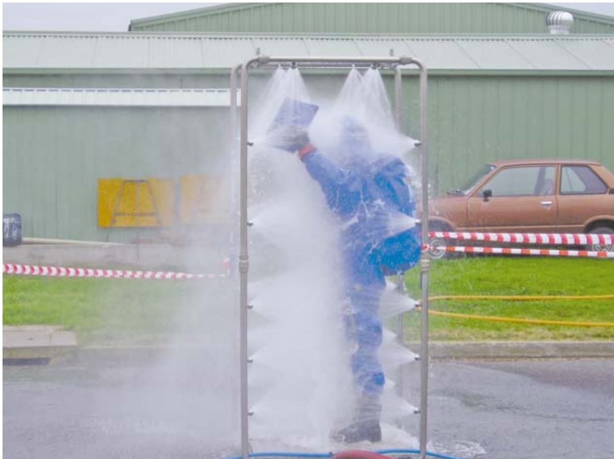
CBR Crime Scene Investigation – Students wearing Level A protection with self contained breathing apparatus undergo decontamination.

One of the key outcomes for the working group was the development of procedures for handling suspicious packages in 2001. The anthrax letters in the USA were the catalyst for the rash of white powder incidents in Australia that began in mid October 2001.