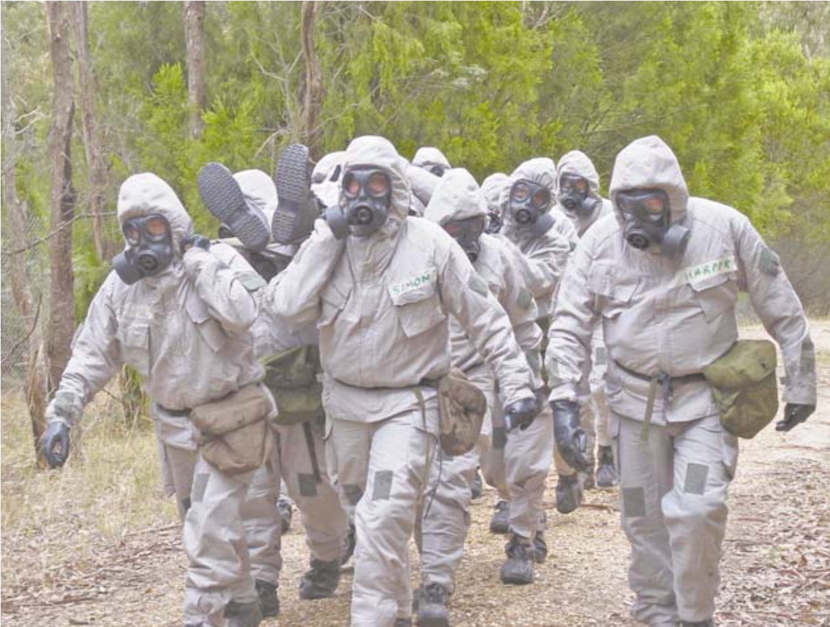
CBR Incidents and Emergencies – Casualty evacuation is hard work when wearing protective clothing

CBR training continues to evolve as new techniques are developed and new challenges emerge. Some may argue that a CBR incident may never occur. Let's hope it never does, but if it does, we must be prepared— training is the key.