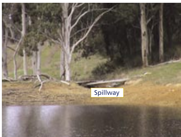
An under-designed spillway; its size is clearly too small for this 100 ML impoundment. The spillway is also badly maintained as the owner allows physical obstructions, including a walkway bridge and sandbags, to be present across the spillway restricting its potential capacity.

to a minimal extent. Adequate assurance can only be provided through the implementation of appropriate policy which requires the backing of law-makers. The results of the case studies reported here should encourage such backing in South Australia and other policy-absent jurisdictions. The policy and laws implemented in Victoria serve as a good example for others to follow. However, effective and efficient administration of laws is also vital as evidenced by the Victorian case study.