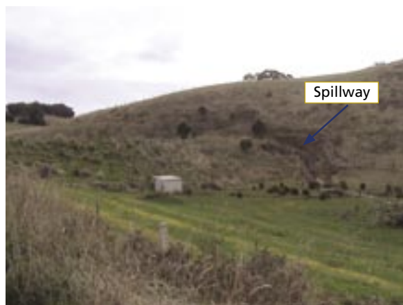
A poorly designed spillway as it undercuts and weakens the dam wall: the potential exists for the wall to collapse at any time, particularly during a significant overflow event.

In South Australia, concern over the need for private dam safety assurance policy has been expressed by many over the past 20 years. For example, Pisaniello and McKay (1998a) makes reference to a Flood Warning Consultative Committee report of 1990. More recently, a flood study of the Kangaroo Creek Dam, in the Torrens catchment of South Australia (LDC & SMEC, 1995), found that the peak inflow to Kangaroo Creek would increase fourfold if all the small dams in the catchment failed at the same time (reasonable assumption for an extreme flood event), compared to the flow estimated if the dams remained intact. In such an event, the design flood of Kangaroo Creek Dam would be exceeded. The study thus recognised the need for "controlling the standard of construction of farm dams and their spillways."