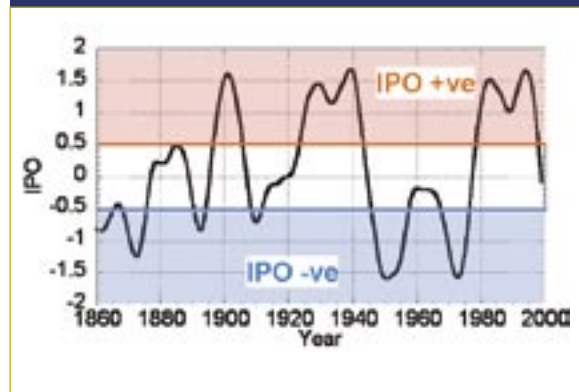
Figure 3. Inter-decadal Pacific Oscillation index (1860-2000) – data supplied by the UK Meteorological Office.