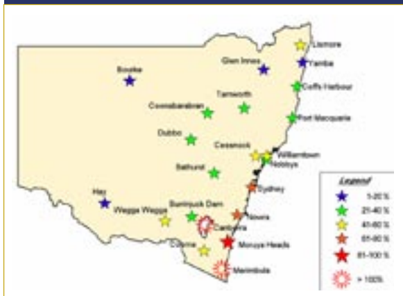
Figure 2. Percentage increases in NSW bushfire risk under El Niño conditions compared to non-El Niño conditions.

forthcoming season or year. This enables adaptive management decisions to be made and damage minimisation procedures to be put in place before the period of elevated flood or bushfire risk. Such climate risk management strategies, based on insights gained through extensive research into ENSO and other climate processes, are now routinely applied in various domains (e.g. agriculture) in Australia and many other regions (see Meinke et al. (2005) for a useful overview).