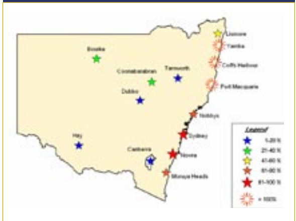
Figure 5. Percentage increases in NSW bushfire risk for El Niño events under IPO negative conditions compared to El Niño events occurring in non-negative IPO phases (see Verdon et al. (2004a) for further details).

Figure 5 shows the percentage increase in bushfire risk when IPO negative El Niño events are compared with all other El Niño years. In comparison to Figure 3 (where all El Niño events were compared with non-El Niño events and it was shown that bushfire risk is elevated during El Niño events) it can be seen that IPO negative El Niño events are associated with an even greater risk of bushfire than the non-IPO negative El Niño events. This supports the notion that the magnitude of ENSO impacts is enhanced during periods when the IPO is negative and implying that bushfire risk is extremely high during IPO negative El Niño events when compared to all other years.