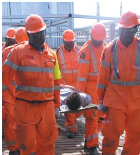
The aim of the strategy is to improve community safety in remote indigenous communities.

The National Emergency Management Strategy for Remote Indigenous Communities: 'Keeping Our Mob Safe' is accessible on the EMA website at www.ema.gov.au .