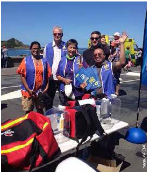
Community members are encouraged to promote preparedness in their local areas.

effective and efficient from the outset. We have experienced a huge surge of interest since revamping this program because the approach supports a way for anyone to get involved and contribute.