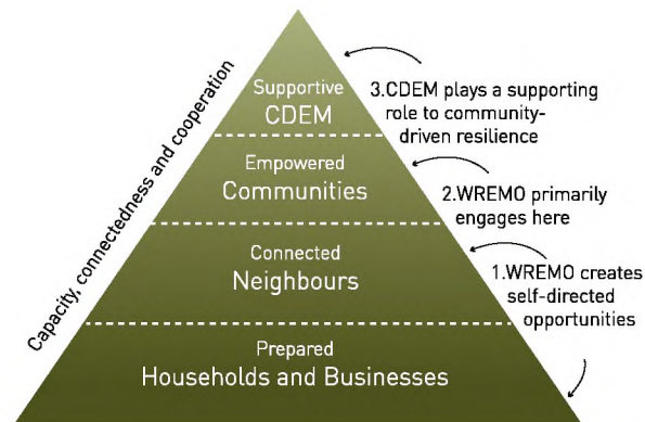
Figure 1: Model of Community-Driven Emergency Management.

To help guide our resilience compass north, the team developed a Community Resilience Strategy that provides a set of engagement principles, such as 'listen first' and 'focus on local solutions', as well as a range of tools for individuals and organisations to get involved in ways that are appropriate for them, not us. Instead of educating everyone to achieve 'Rambo Level 5' preparedness, the approach has focussed on developing a wide range of tools that cater to diverse interests and levels of commitment. For the less enthusiastic, minimal engagement might be through a painted blue tsunami marker line on the road or nothing more than following WREMOnz on Facebook. For those who have greater interest or time, completing a CDEM volunteer training program or participating in the creation of community response plans helps build capacity and foster co-operation. A Continuum of Engagement model presented in Figure 1 provides an example of how these tools are represented by a person's level of interest.