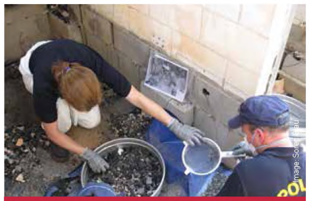
A forensic anthropologist and VicPol assist in the examination of a scene following the 2009 Victorian bushfires.