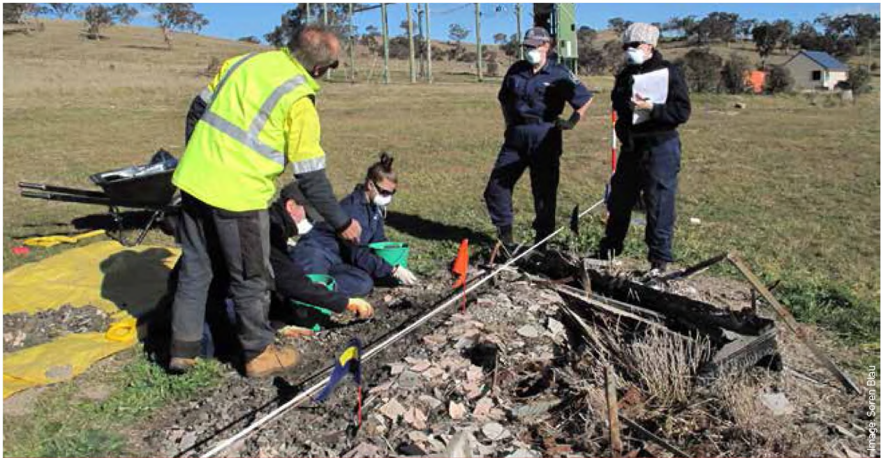
A forensic archaeologist provides training to police members in the archaeological recovery of evidence.

process following the 2009 Victorian Bushfires (Blau & Briggs 2011).