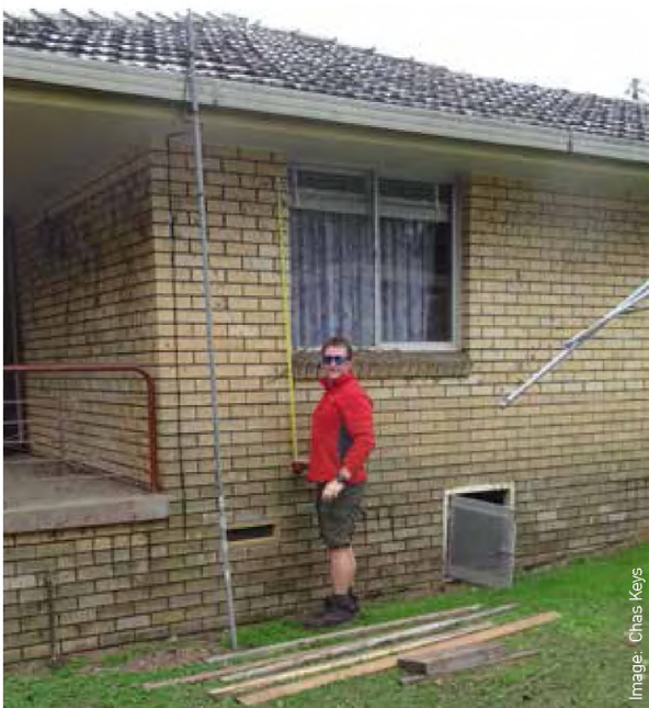
Many dwellings in Dungog were flooded to ceiling level, including these units in Brown Street.

The April 2015 flood in Dungog taught that whether because of the scale and speed of the event, split resources, inadequate numbers, leadership transitioning, local road closures and communications difficulties, emergency services organisations cannot be guaranteed to rescue everyone in need of rescue. Sustaining the capability of emergency services to respond well over the sometimes long periods between floods requires good plans, local ownership of those plans, scenario testing, organisational renewal, and smooth transitions in leadership.