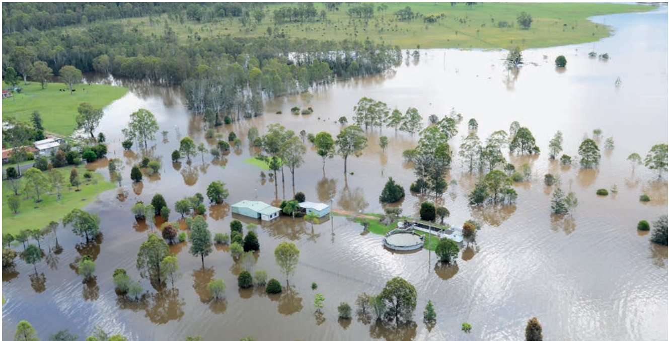
The Clarence River has flooded areas around Grafton, NSW, four times since 2009, significantly affecting many rural properties, such as this one in February 2013.