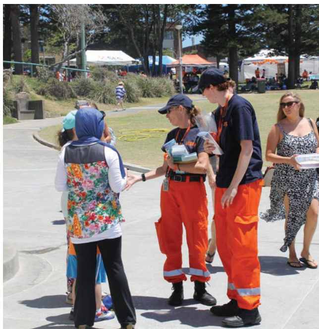
NSW SES personnel speaking with people about the tsunami risk in their local area.