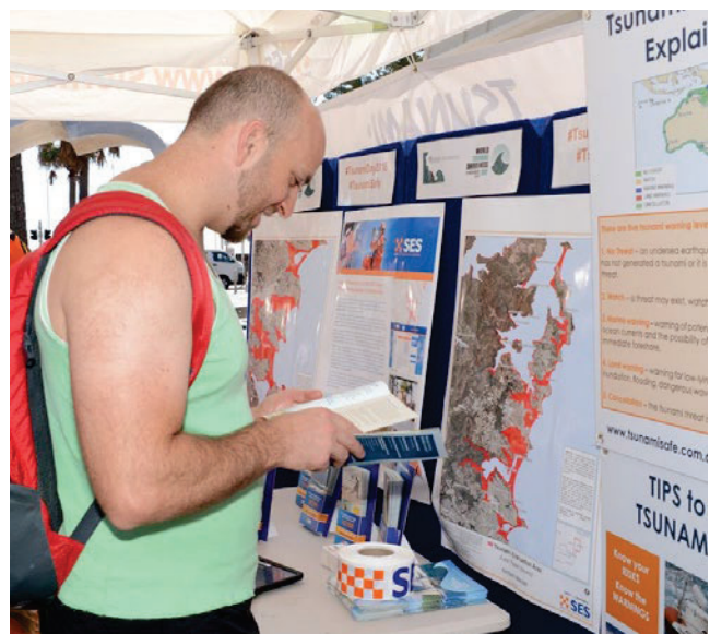
Using local maps should be part of community-based planning for a tsunami.