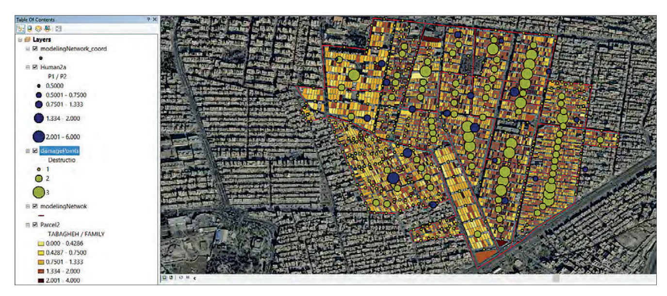
Figure 2: Input data illustrated in GIS to use in the DMCsim for District 17 of the city of Tehran, Iran simulation.

The DMCsim result and evaluation for this case study experimentation demonstrates that if, for instance, an earthquake of level 1 intensity or damage level hit the study area and available responders were deployed to