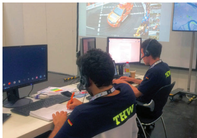
The VOST in Germany during a deployment for the Tour de France cycling race in 2017.

In recent years, the VOST concept has spread quickly, first within the United States and now to other regions including South America, Europe and Oceania (VOSG 2018). As the VOST idea has spread, a lively and international community has grown. While this growth has been accompanied by a wealth of anecdotal evidence concerning the benefit of VOSTs, little systematic research has been conducted to examine the growth and formal utility the movement presents to emergency and disaster management.