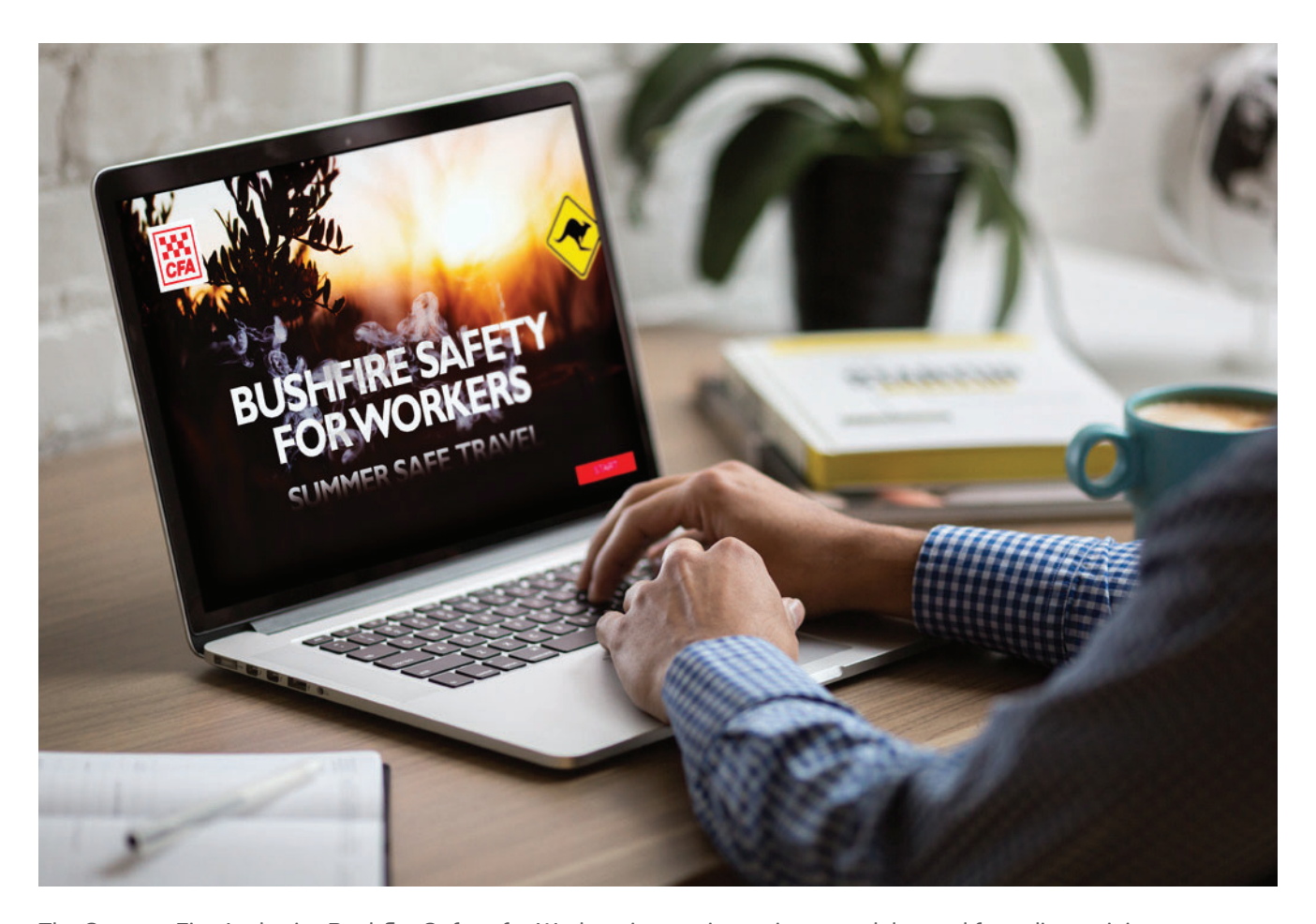
The Country Fire Authority Bushfire Safety for Workers is meeting an increased demand for online training.