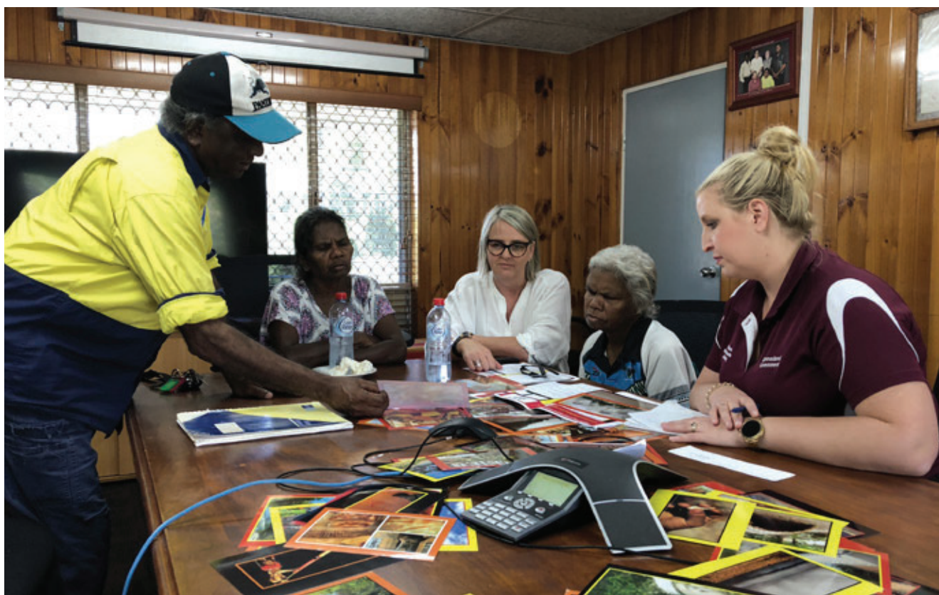
Wujal Wujal community elders worked with Queensland Reconstruction Authority staff to develop the recovery plan.