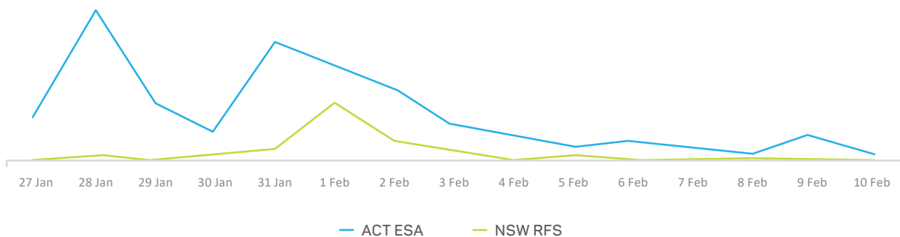
Figure 1: Orroral Valley Fire/Clear Range fire posts per day.

Both agencies provided regular updates on their Facebook pages about what was going on in the various firegrounds and, observing the requirements of the national warning system, provided predictable updates depending on the level of warning. ‘Emergency’ warning level requires an update every 30 minutes, ‘watch and act’ every 2 hours and ‘advice’ level every 24 hours. Both agencies provided different levels of detail in their posts but were consistent in the provision of that information on a predictable basis. In line with the framework, both agencies consistently used coloured banners to highlight the current warning level so that people could see it at a glance. However, on a small mobile screen, the coloured banner was not visible until the user scrolled to the bottom of the post.