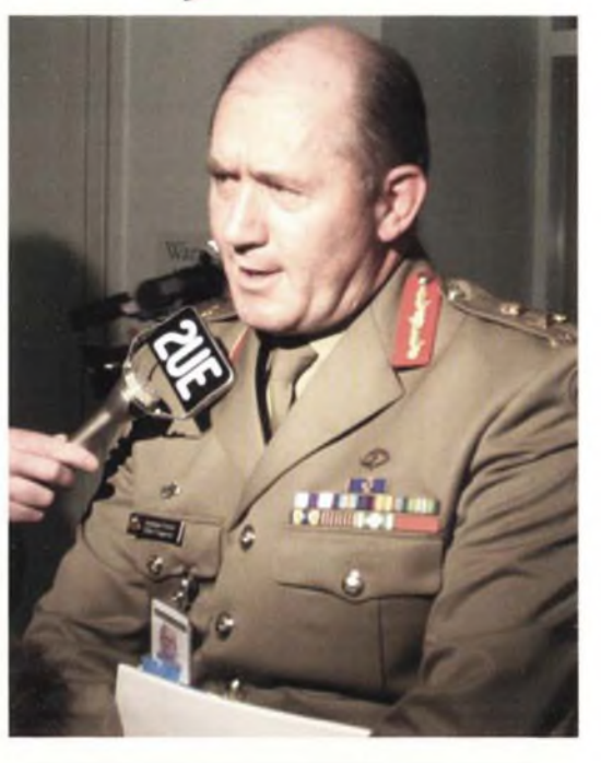
Chief of the Army, Lieutenant-General Peter Cosgrove, gave evidence to the Foreign Affairs, Defence and Trade Committee's inquiry.

Call: (02) 6277 2313 Email: jscfadt@aph.gov.au