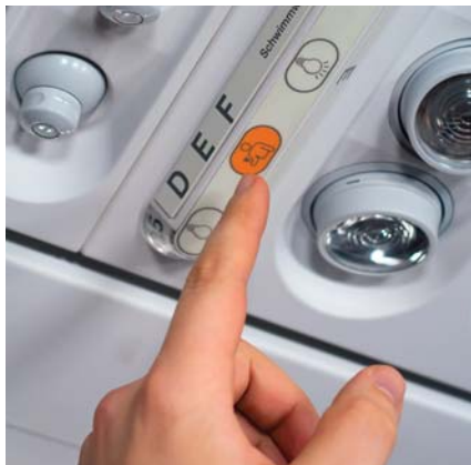
UP IN THE AIR: Cabin crew changes examined.