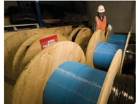
ROLLOUT REVIEW: Regular reports will be delivered on the NBN.

For more information visit www.aph.gov.au/jcnbn or email jcnbn@aph.gov.au or phone (02) 6277 2322.