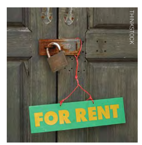
LOCKED OUT: Migrants face tough search for housing

For more information visit www.aph. gov.au/mig or email jscm@aph.gov.au or phone (02) 6277 4560.