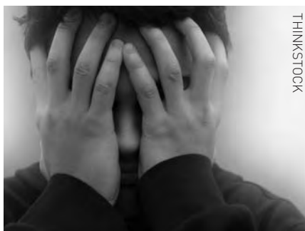
HEADS UP: Drawing attention to the rise of early onset dementia

“We must make progress to further educate the public on this health problem,” she said.