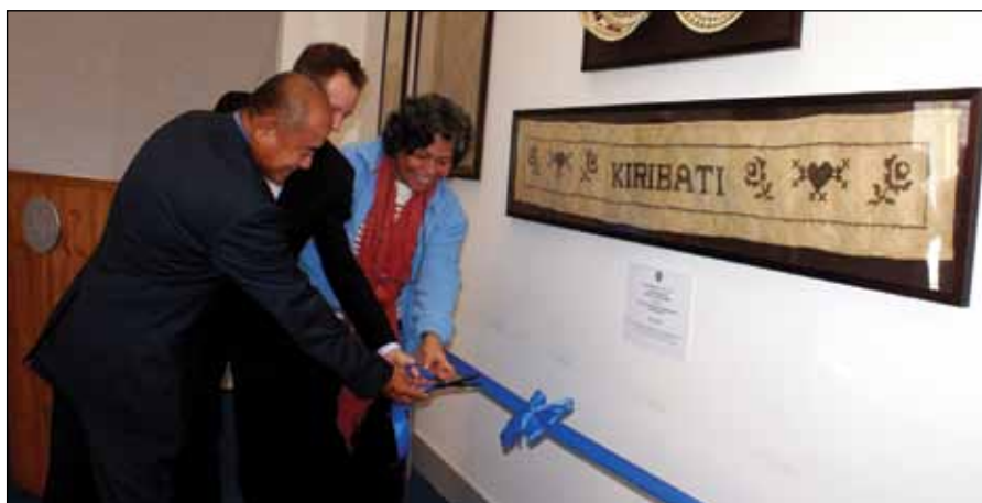
PACIFIC PARTNERSHIPS: Kiribati Room opening at the ACT Legislative Assembly

Please include name, address and daytime contact details. Letters may be edited to fit available space and for clarity.