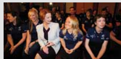
PRIDE OF THE NATION: Paralympians with PM Julia Gillard at Parliament House

Prime Minister Julia Gillard, Opposition Leader Tony Abbott, Minister for Sport Kate Lundy and Minister for Disability