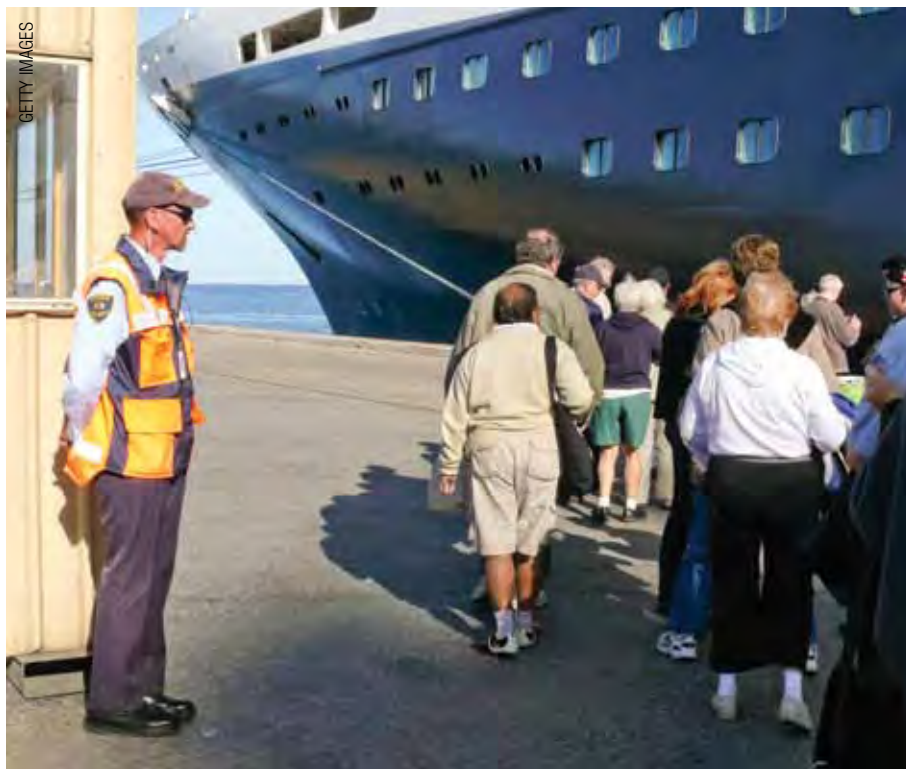
ALL ABOARD: Cruise industry gets serious about safety

www.aph.gov.au/ic ic.reps@aph.gov.au (02) 6277 2352