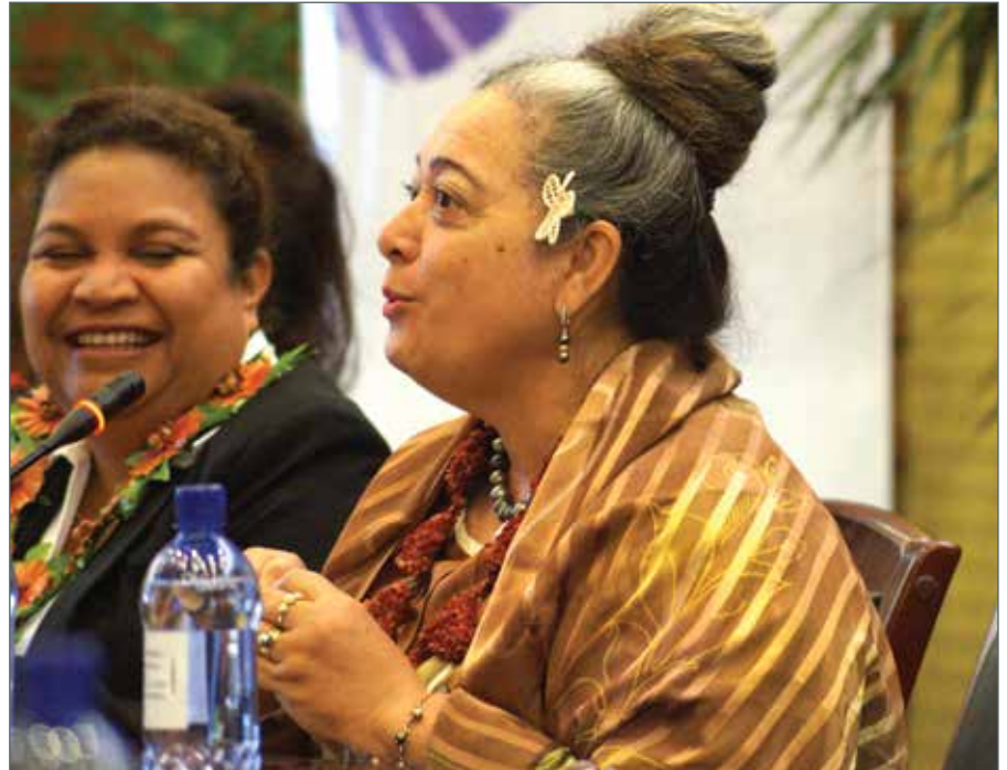
▶ LEADING THE WAY: Pacific women MPs are breaking down barriers

W omen parliamentarians from across the Pacific region and Australia have joined forces in an effort to boost women's participation in politics and women's representation in parliament.