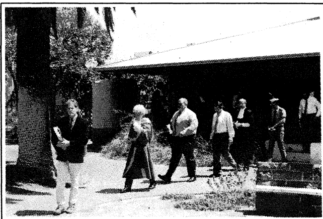
The 1996 Opening of the Legal Year begins ... Alice Springs