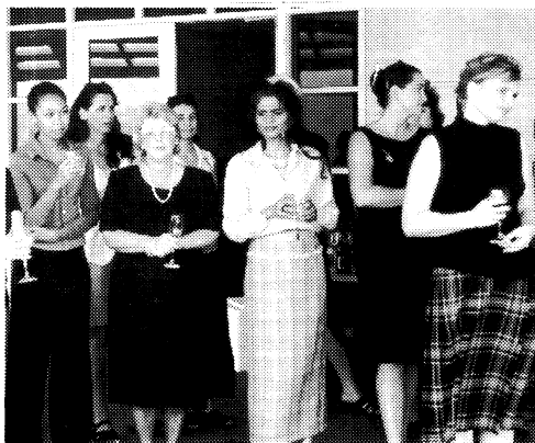
Women lawyers at the reception on the Judges Balcony of the Supreme Court on 14 April 2000

Trials Through Time this year consisted of three radio plays being recorded by