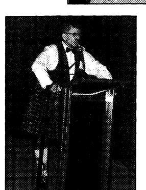
Above: Thanks to Lajamanu Rodeo....