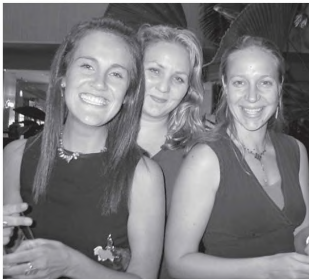
The local legal profession turned out in force for this year's Law Society Christmas drinks