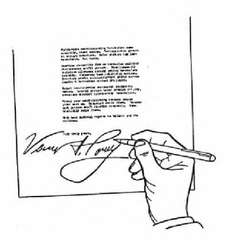
THIS IS MY SIGNATURE. It is big. It is hard to read. Some people have little signatures that are easy to read. They never make over a thousand a week.