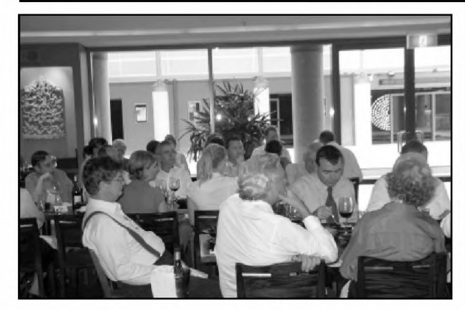
Enjoying the Darwin OLY address