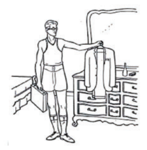
THIS IS MY SUIT. Colour it gray or I will lose my job.