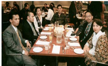
Welcome Dinner for Indonesians 2001

The first workshop was held for 15 Indonesian officials in April -July 2001. The second workshop is taking place from April to June 2002, for 19 Indonesian government officials. In addition to a number of external experts engaged specifically for the workshops many lecturers from within the Faculty have been involved in the delivery of the workshops and seminars.