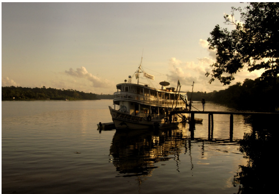
Fig 2: The ‘Tribuna’