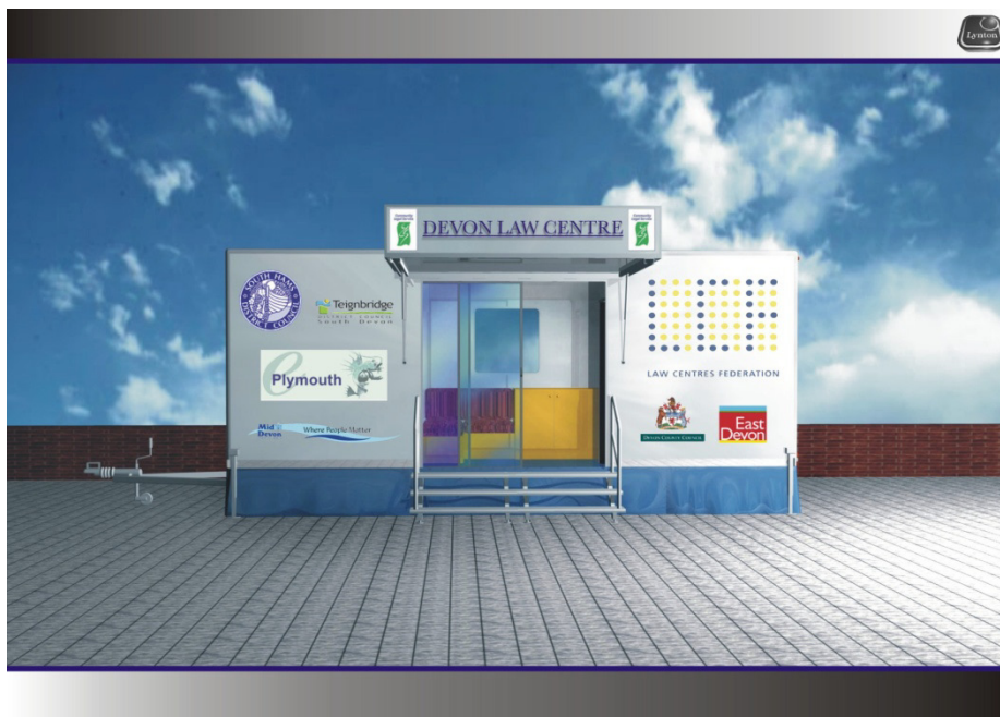
Fig 1: Devon Law Bus