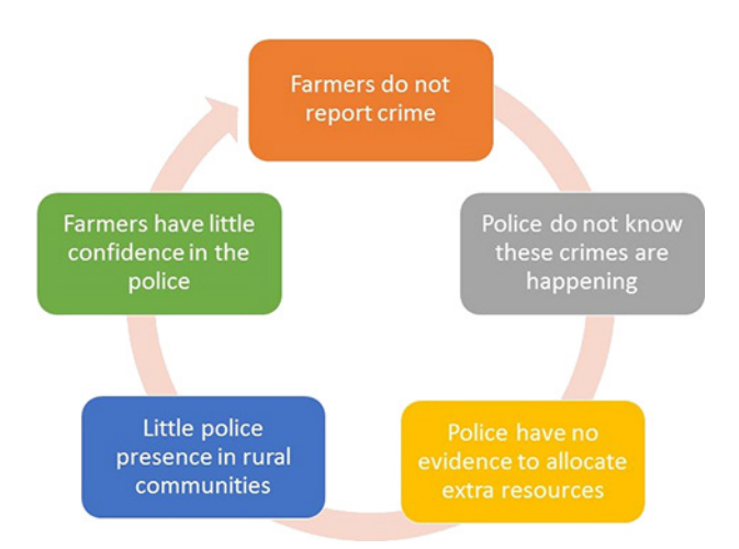
Figure 3 Cyclic issues affecting the policing of farm crime in the British countryside