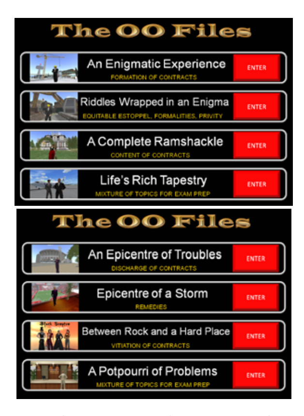
Figure 1: image maps in Blackboard with hotspots which launch Quizmaker modules when clicked

The program comprises a total of 180 short fact scenario questions which follow the same format of allowing unlimited attempts and providing both detailed feedback on correct responses (including relevant case and legislative authorities) and feedback on incorrect responses (which explains why the response is incorrect and/or redirects the student's attention to that part of the question that will yield the correct answer).