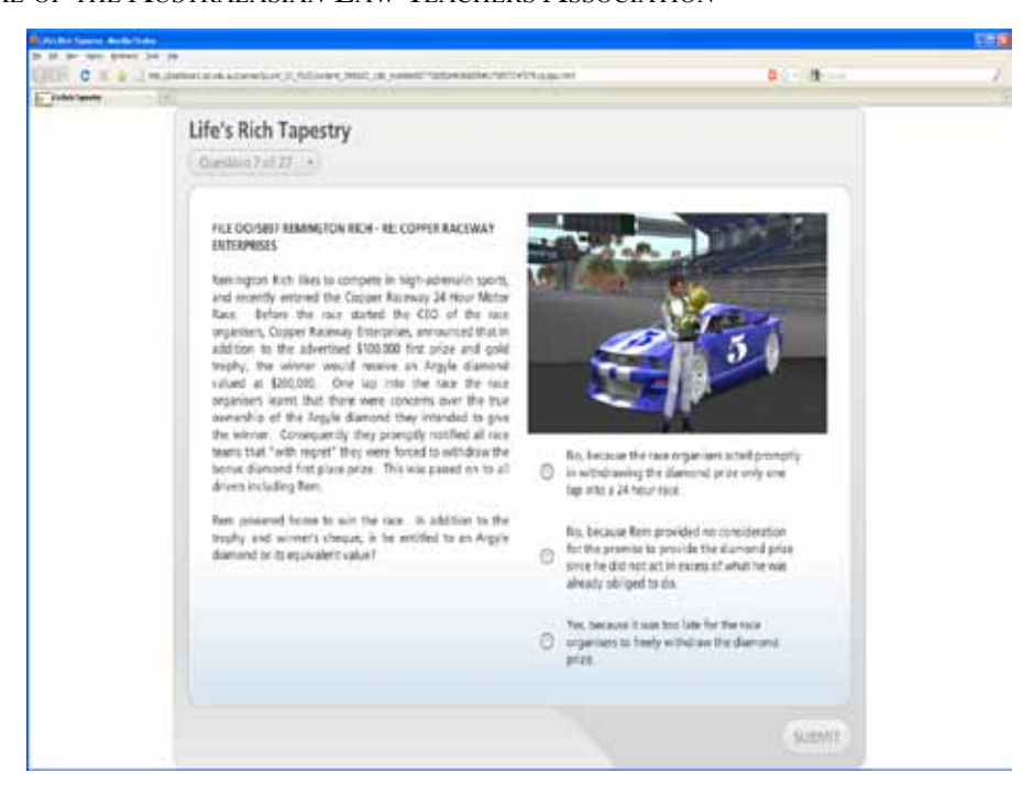
Figure 2: the Adobe Quizmaker interface, featuring a short fact scenario question illustrated by a Second Life image