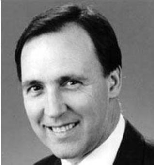
Figure 1. Paul Keating, c 1985

What is the extent of Paul Keating's contribution to tax reform while a parliamentary member of Australia's House of Representatives (1969-1996) that includes his time as Federal Treasurer (1983-1991) and Prime Minister (1991-1996)? Even sixteen years after leaving politics, Paul Keating still has a presence in the discourse on contemporary Australian policy. Witness his book of recent speeches and sell-out formal public lectures. 1 It is now timely to examine the extent of Keating's contribution to tax reform.