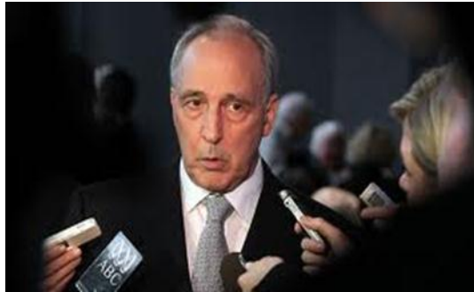
Figure 2. Paul Keating, c.2012

Some believe Keating simply marketed the tax reform ideas of others to the electorate; or alternatively, using the metaphor of a tax alchemist, he transformed existing tax reform ideals and built upon them. Major tax initiatives during Keating's public life include dividend credits, the Capital Gains Tax, Fringe Benefits Tax and the Petroleum Resource Rent Tax. The introduction of compulsory contributions to superannuation (retirement pension funds) might also be added. 2 There were also failures; such as his proposal to introduce a consumption tax, in the form of a retail sales tax. Given Keating has actively proffered opinions on government policy since leaving parliament, his public work provides a framework to compare societal aspects of past tax reform to current tax reform initiatives.