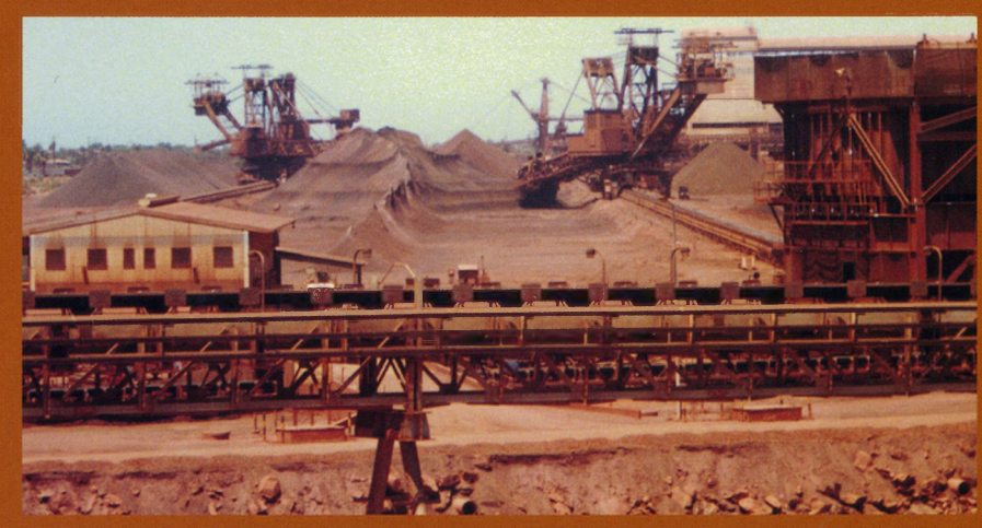
Huge loading yards, such as this iron ore storage, keep the Pilbara ports busy day and night

Sydney before becoming District Manager at Port Hedland, describes the Pilbara as a fabulous place for work.