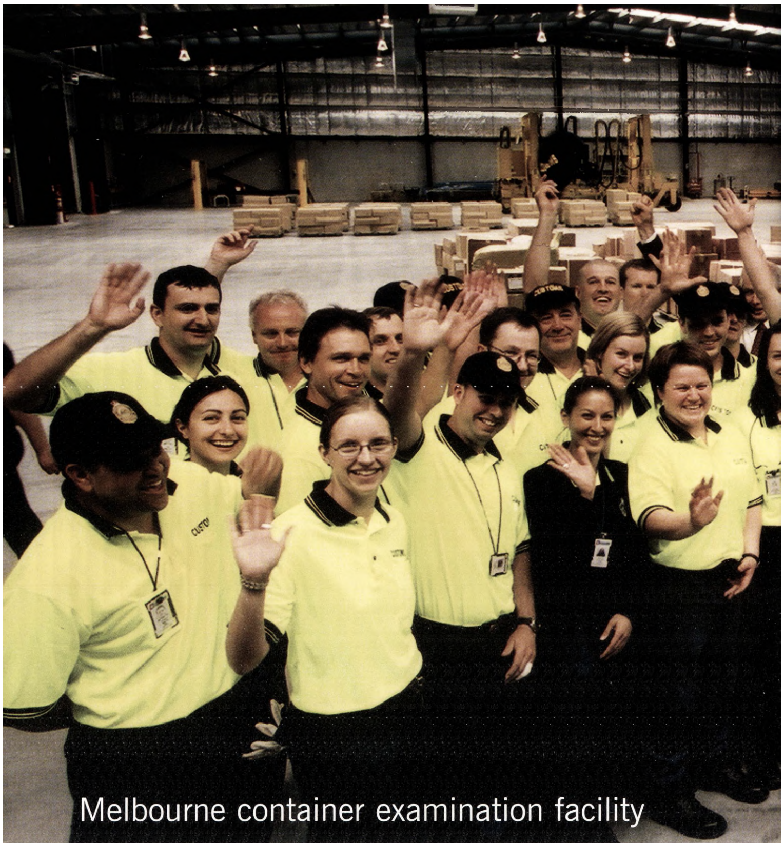
Melbourne container examination facility