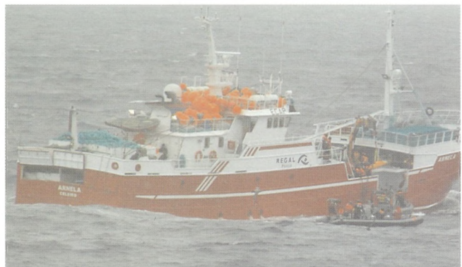
top: The Australian Customs medical team transfers the sick man onto the Oceanic Viking mid-Southern Ocean